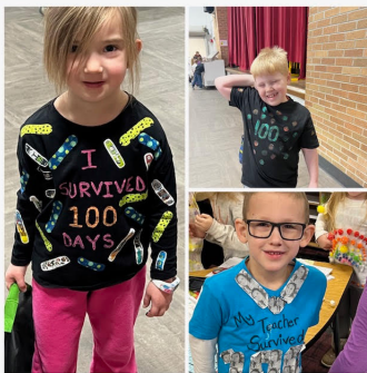
100 Days of School