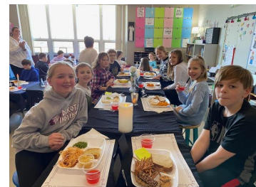
4th Grade Students Enjoying a Fancy Lunch